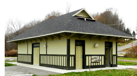
Recent projects along the trail include the completion of a replica Freight House at Rochester Junction

In many ways our signature project, we developed ( through a federal grant ) and maintain Monroe County's 14 mile linear trail encompassing the old Lehigh Valley Railroad bed in the towns of Mendon and Rush.