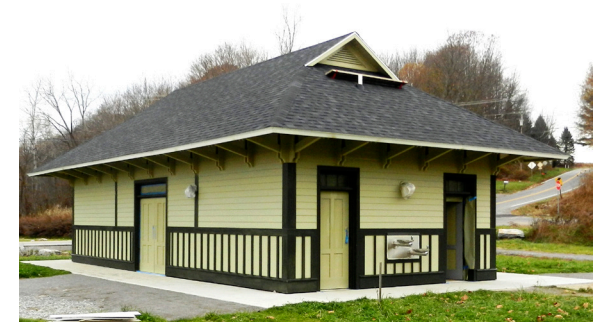
Projects along the trail include the completion of a replica Freight House at Rochester Junction

In many ways our signature project, we developed ( through a federal grant ) and maintain Monroe County's 14 mile linear trail encompassing the old Lehigh Valley Railroad bed in the towns of Mendon and Rush