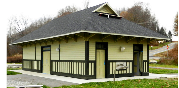
Projects along the trail include the completion of a replica Freight House at Rochester Junction

In many ways our signature project, we developed ( through a federal grant ) and maintain Monroe County's 16 mile linear trail encompassing the old Lehigh Valley Railroad bed in the towns of Mendon, Rush, Scottsville, and Caledonia.